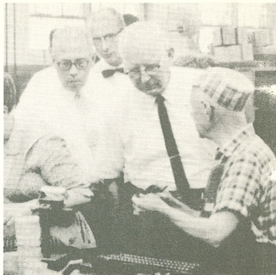
A worker at Best Lock Company demonstrates methods of tumbler assembly to the faculty.