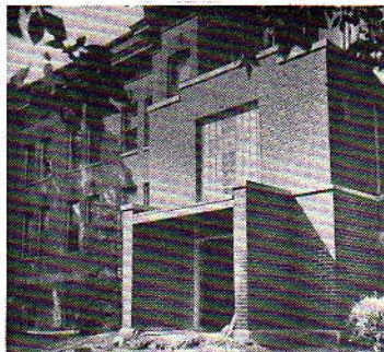
Historic Schultz Hall underwent major changes during the summer. Shown are remodeled side and east entrance. Story on page 3.