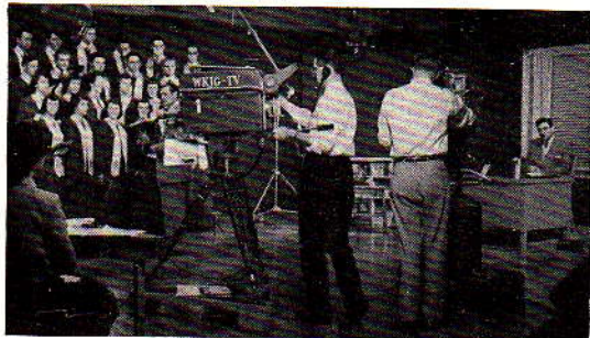
The group which presented a Lenten telecast in the studios of station WKJG-TV recently is shown above rehearsing for the program shortly before air time.